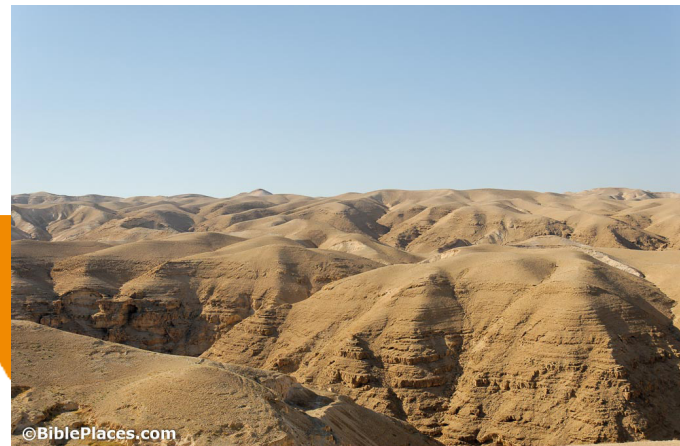
Wilderness of Judea where Jesus was tempted

Rabbinic Tradition: Ben mentioned a non-Biblical, rabbinic tradition that stated that the